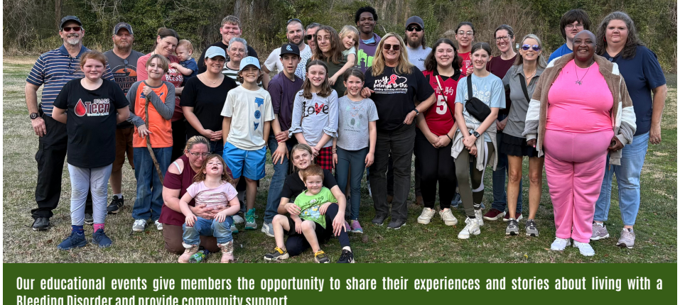
Bleeding Disorder and provide community support.

Our mission is to promote awareness, provide education, and offer support to the Bleeding Disorder community. We were able to fulfill 100% of the financial assistance requests that were summited in 2024. We also need support for our advocacy efforts, promoting policies that promote better access to quality, affordable healthcare for people with chronic conditions like hemophilia and other inheritable bleeding disorders. None of this would have been possible without your support.