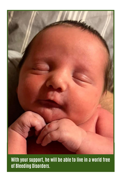
Even our youngest members learn to advocate for

themselves, be it in school, or at the State House.